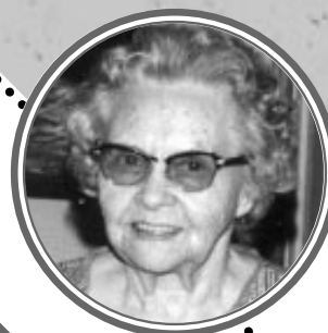
1960 Moved to Kentucky Drive