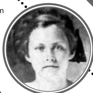
1914 Moved to Town Leland, Iowa