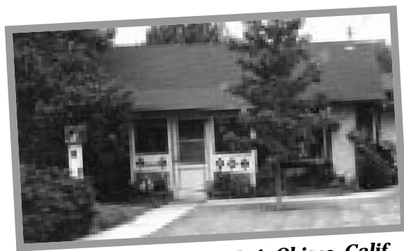
441 Kentucky Blvd., San Luis Obispo, Calif.

It was just used for our regular living expenses, because at that