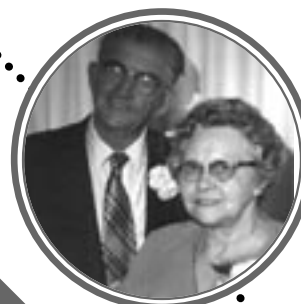
1957 Moved to San Luis Obispo California