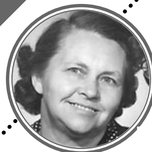
1929 Moved to the Thompson House