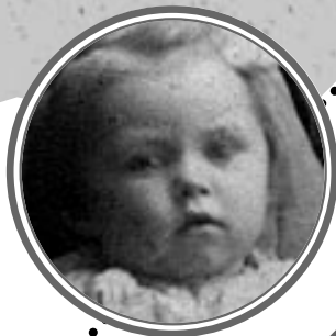
1903 Born in Mineral Ridge, Iowa