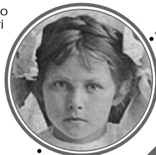
1905 Moved to Missouri